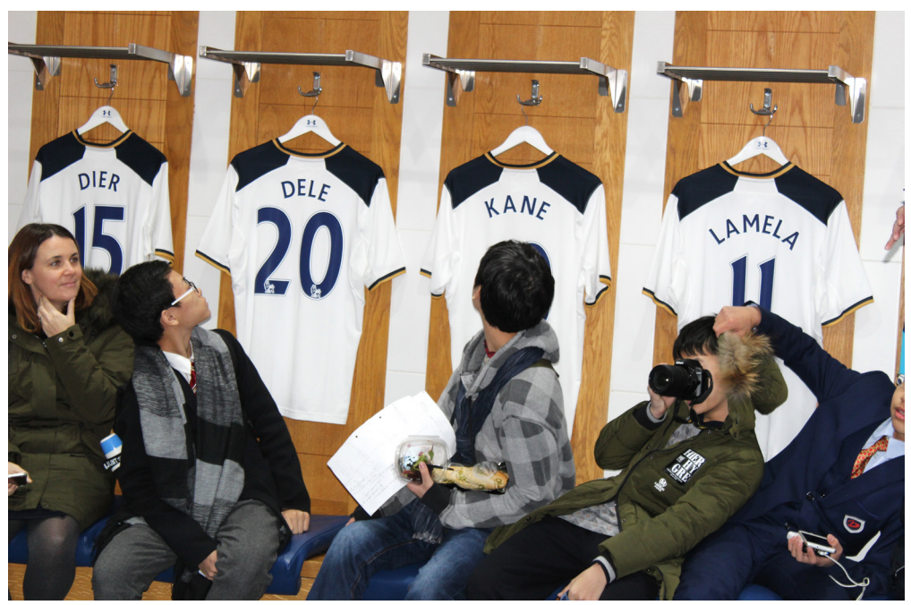
Tottenham Hotspur Changing Room

A 'must see' fixture for our Chinese students was a visit to Tottenham Hotspur Football Club. They saw the pitch, the press gallery, the VIP lounge and the changing rooms.