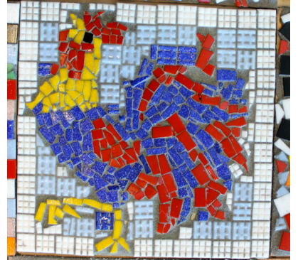
One of eighteen magnificent Chinese New Year roosters

The students were provided with large trays of coloured mosaic pieces, cutting tools and protective goggles to avoid possible accidents. They worked feverishly cutting and sticking pieces of tiles onto wooden boards. Bold and colourful shapes of roosters began to emerge.