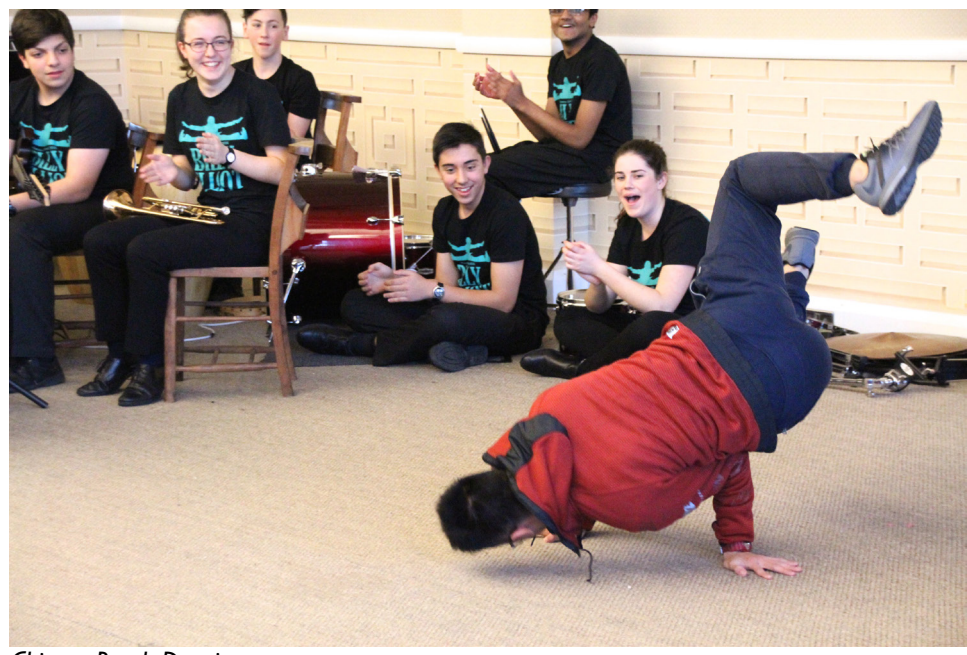
Chinese Break Dancing

It was an exhausting day. Five doors down and five hours later, dinner at a local Chinese restaurant was the perfect setting to round off a perfect day. One hundred and twenty students, teachers and parents enjoyed dinner together in the large, traditionally decorated Cantonese dining room. They enjoyed old-style dim sum, steamed pork ribs, rice rolls, prawn rolls and a variety of carefully pre-chosen dishes from a menu that could have stretched to China and back.