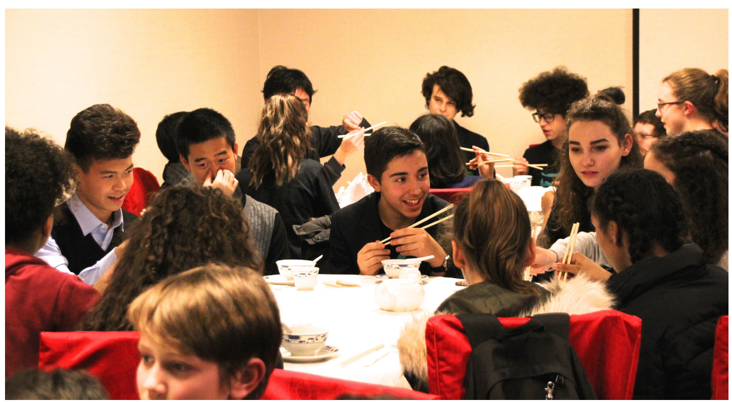
One Hundred and Twenty for Dinner in Chinatown

That said, ushering one hundred and twenty wired students, teachers, instruments onto two huge coaches parked in Shaftsbury Avenue during the rush hour, was a challenge. We counted them on, we counted them off. Seeing everyone back in school for an early start the following morning, was a testamony to the professionalism and leadership of the teachers in the Expressive Arts Faculty who planned and organised every step of the event.