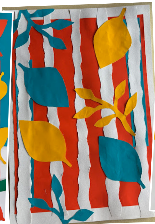
Giselle Tashi 7B