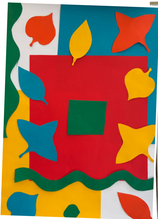
Gulce Aydin 7B