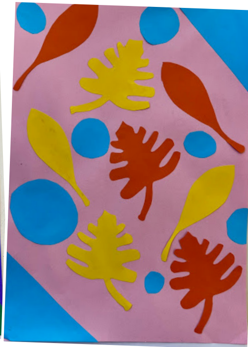
Sophia Etan-Pickup 7L